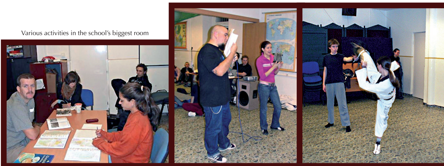
Various activities in the school's biggest room

The school is open from 9 a.m. to 7 p.m. on working days and is intended to be a pleasant space that is worth coming to as part of one's daily life. This is particularly important as the students come from difficult backgrounds. The school operates in a family atmosphere, ensuring a safe and accepting environment for the youth, and serves as a kind of home for many. Every room is accessible to everyone; even the staff room is used by both teachers and students and has become the heart of community life. One special contribution to the informal environment is that there is no organised school meal; students eat in the rest area or the staff room.