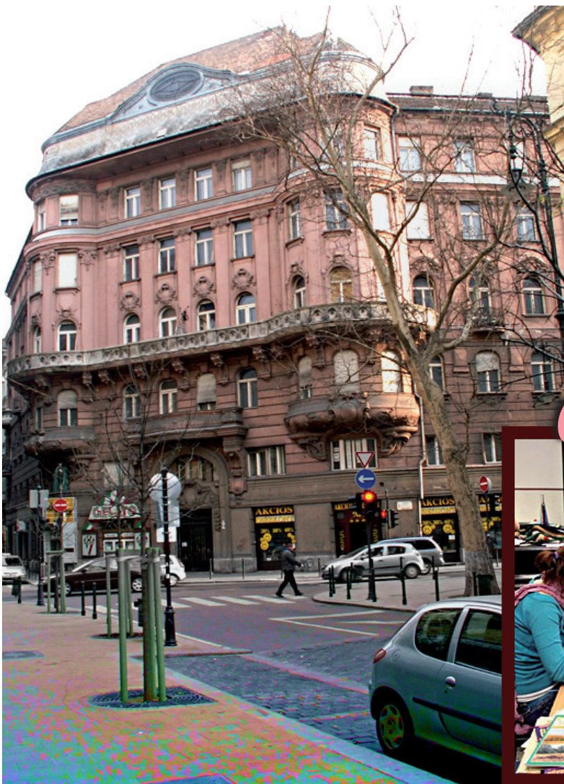
Belvárosi Tanoda Secondary School in Budapest

The Belvárosi Tanoda (which translates as downtown school) is a second chance school for students who have dropped out of upper secondary education. It has been providing alternative education for 16- to 25-year-olds since 1990. While most Hungarian schools are run by their local government, Belvárosi Tanoda is maintained by a private foundation, with the state covering about half of its operating costs. The school charges no tuition fees since most of its students are in financial need.