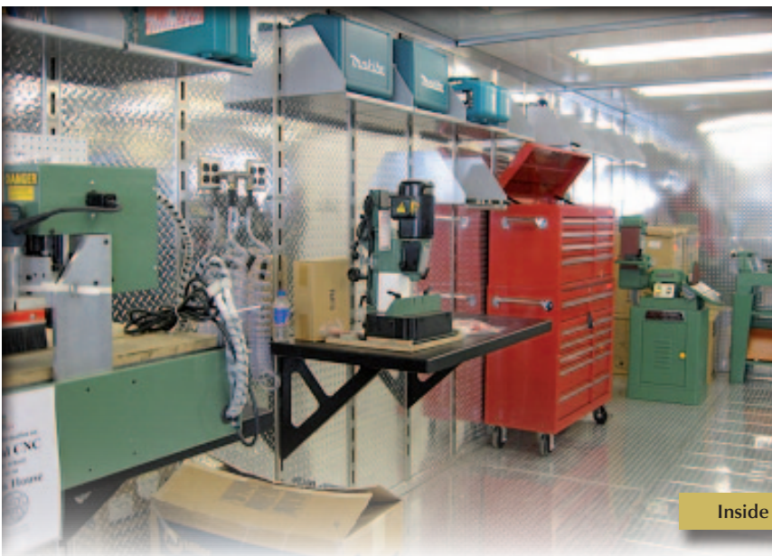
Inside a mobile CTS unit