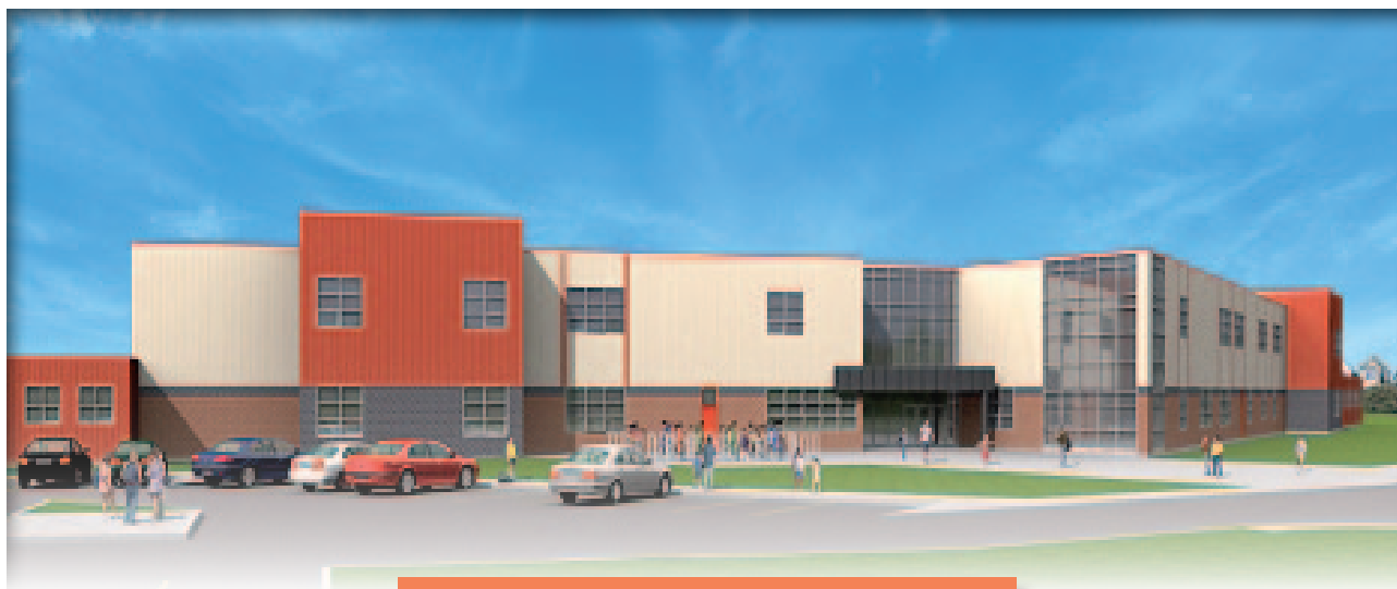
Artist's rendering of an Alberta core school design

Portable classrooms of the past were usually considered temporary measures to address short-term needs, and the quality of their construction and design was commensurate with that expectation. Today's modular classrooms are comfortable, efficient and highly effective learning environments. The interiors look like permanent classrooms, thanks to the use of painted drywall, drop ceilings and large windows. The units are durable and are designed to allow multiple moves. Alberta's new school designs incorporate modular classrooms as an intentional and integral part of the building's functionality.