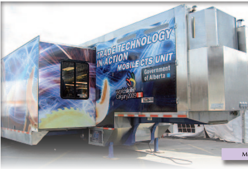
Mobile CTS unit