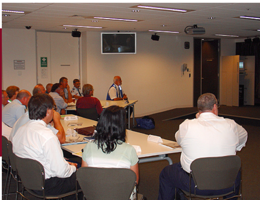
Exercise Socrates at police headquarters for secondary principals

During the simulation, principals respond to information that is provided, decide on actions that need to be taken in response to emerging issues in the scenario and outline their reasons for making particular decisions. The principals then work with police to develop a better understanding of and mutual respect for the actions required of each to effectively manage the same incident.