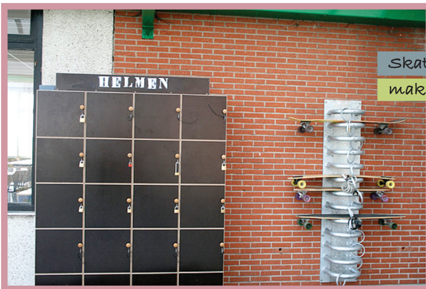
Skateboard lockers make life easier

Lastly, we asked if the impact of school infrastructure is the same for all students. In order to answer this question we investigated, for instance, whether the effect on well-being of attending a school with good quality school infrastructure is the same for male and female students, for arts students and vocational education students. On the whole we found that female students are more sensitive to school infrastructure than their male colleagues and that 9th grade students are more sensitive than 10th grade students. We also found that general education students are less sensitive than other students. One very specific finding was that vocational education students are much more sensitive to well-integrated information communication technology (ICT) compared with other students.