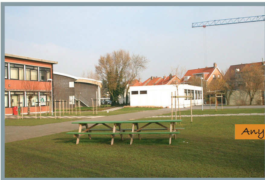
Anyone for a picnic?

Rights reserved; © University of Antwerp